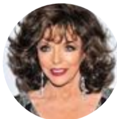
Actress and author, Joan Collins, is an ambassador for door-to-door luggage service, First Luggage (firstluggagevip.com).

Holders Festival, but we also stayed for 10 days in a glorious house with a wonderful sea view.